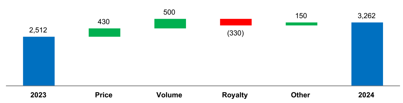
Price – Average bitumen realizations increased by $7.11 per barrel, primarily driven by the narrowing WTI/WCS spread and lower diluent costs, partially offset by lower marker prices. Synthetic crude oil realizations decreased by $3.66 per barrel, primarily driven by a weaker Synthetic/WTI spread and lower WTI.

Volume – Higher volumes were primarily driven by Grand Rapids production at Cold Lake, as well as improved mine fleet productivity and optimized turnaround at Kearl.